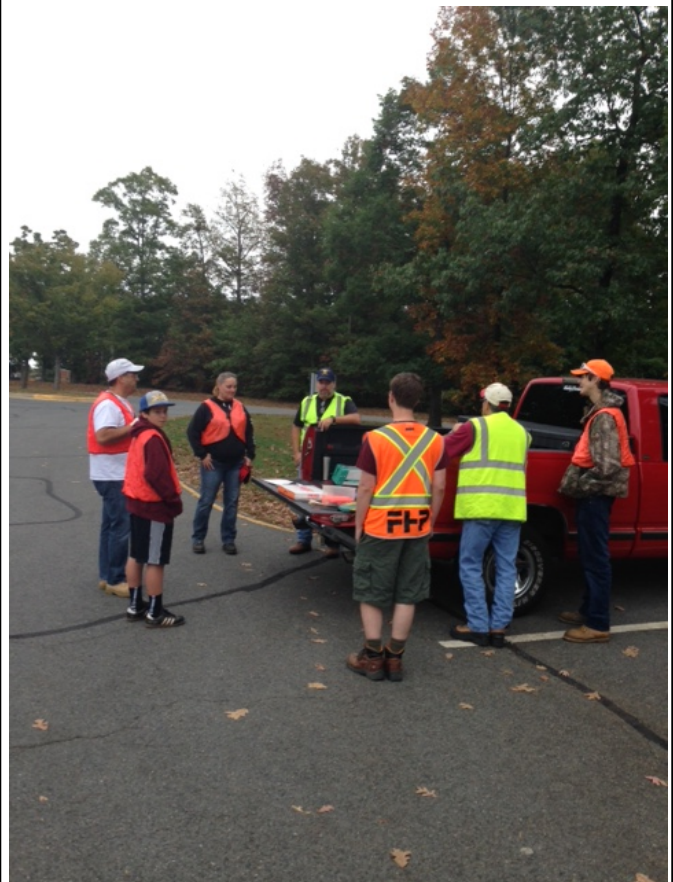
Compton Road Cleanup Oct14th